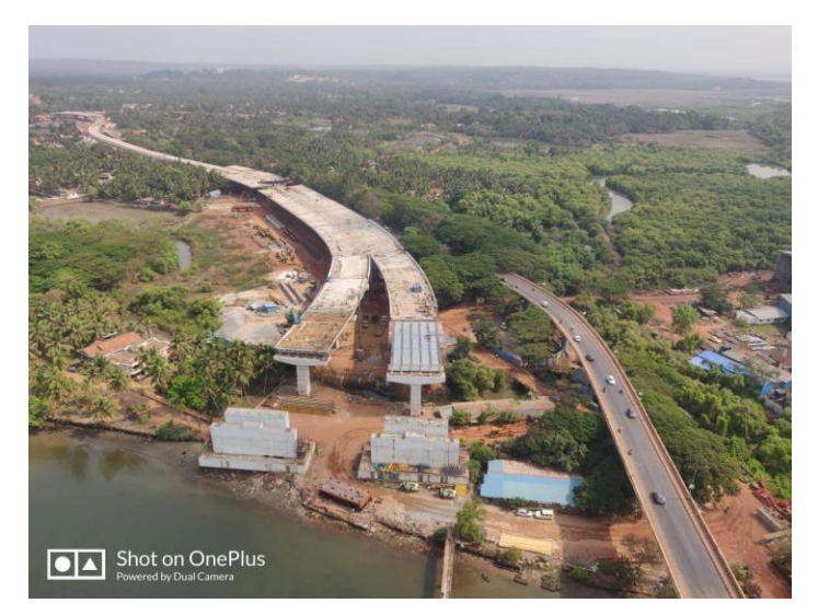
Zuari Cable Stayed Bridge, Goa, India

Website: https://www.master-builders-solutions.com/en-in